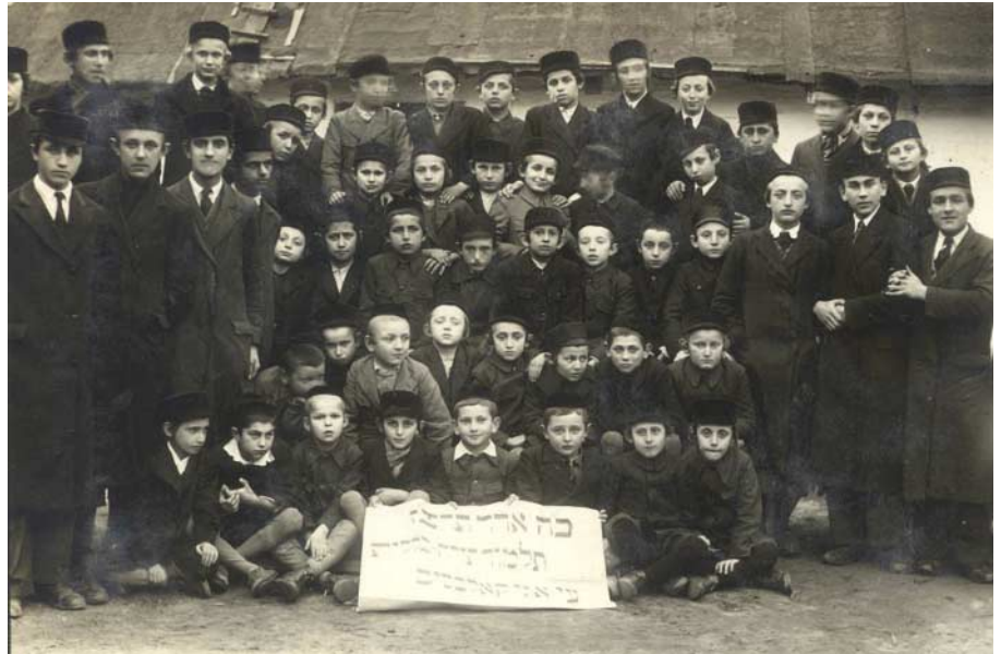
Many Jews are taught racial exclusivity and superiority from an early age, reinforcing the inclinations they inherited and that have been reinforced by thousands of years of life as aliens in the lands of others. Here we see the students at a Talmud-Torah school in early 20th century Poland.

The Talmud, Judaism's most sacred document, exists in two major recensions. The apparently universalist text that Schindler's List quotes appears in the Jerusalem Talmud, the strikingly ethnocentric text in the authoritative Babylonian Talmud. The latter, the real Talmud, contains the authentic text taught in all Orthodox religious schools and memorized by generations of studious young Jews, but less than a moment's reflection will disclose the practical impossibility of including, in a film addressed to a non-Jewish audience, a Talmudic aphorism that so markedly depreciates non-Jewish lives. Spielberg prudently chose instead