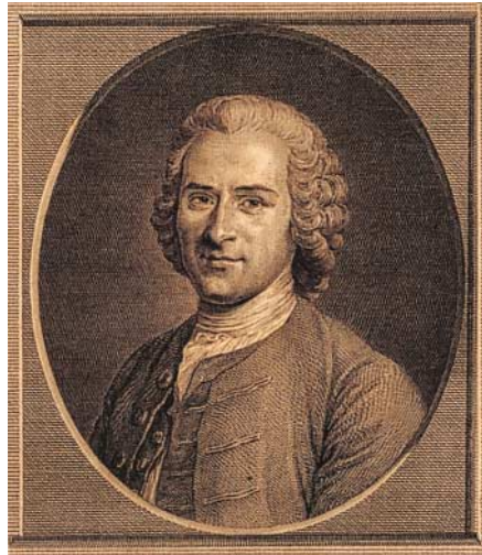
JEAN-JACQUES ROUSSEAU: Promoted religion of 'equality.'

To vary the metaphor to one more suited to an age of apocalyptic hylology, the deadly 'fall-out' from the nuclear explosion of Christianity in the French Revolution had poisoned the atmosphere in which I grew up, but I sadly underestimated its effects—and so did everyone, so far as I know, except, perhaps a few embittered old men to whom no one paid the slightest attention. What the ejuicators had done to the 'high schools' was obvious, and it was also obvious why they were whining and wheedling for legislation to compel everyone of suitable age to enter their booby traps instead of the one-third or so that went through the dipping-vats of their own free will, but my contemporaries and I did not take the 'high schools' seriously, and everyone of any intelligence found his own way to occupy his mind, from composing verse and reading Schopenhauer to some serious study (I began to learn Sanskrit). Colleges were another matter: Only a comparatively small percentage went to college in those days, so that being a 'college graduate' was something of a distinction in itself, and although the country was dotted with colleges, most of them small, and a few already overgrown state universities, they fell, at least in our estimation, into two