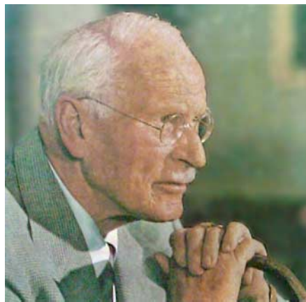
CARL GUSTAV JUNG

Jung wrote a short essay in which he compared Hitler to a shaman or a prophet like Mahomet. So far as the way in which Hitler's authority was accepted by the great majority of Germans is concerned, that analogy had some validity, since Hitler, like other great men, had the unquestioning loyalty of his followers. But, as I remember the essay, which I read more than half a century ago, Jung went on to assert or imply that Hitler reached his